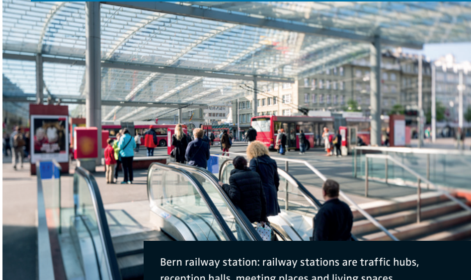
Bern railway station: railway stations are traffic hubs, reception halls, meeting places and living spaces

Station construction, expansion and development – September 2014